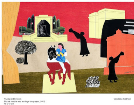
(The work - Trumpet Blowers)

In her very recent collage works, however one sees the artist move towards vibrant colours and more defined forms and intricate detailing. The pen lines of definition strike in many portions of the collage, such as the works, titled, 'City of Turmoil', 'Trumpet Blowers', and 'Life After Liberation'. There is a distinct sense of a language being perfected and spoken in eloquence in these works. City of Turmoil refers to the ideologies of perfect homes and castle like abodes being flattened out by floods, earthquakes and other such nature's calamities and the picture perfect imagery being shattered to smithereens in the minds and hearts of the viewer. The work addresses human greed and a false sense of control over their lives.