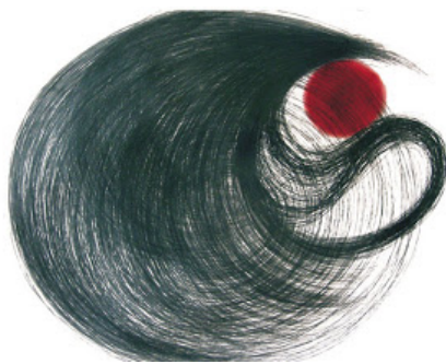
(A painting by Ritu Jain)

The Sunnya Kalashram, New Delhi presents a solo show of art works and a holistic experience of an art expression by artist Ritu Jain. The show is titled, 'Manifest... Unmanifest' for its complete oneness of approach to an artistic experience.