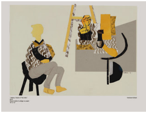
(The work - The Art of looking Sideways)

At one glance playful, at once painful or serious, these collage works bring out the facets of the artist's persona and her thought processes. In one of her earlier collages from 2010, titled, 'The Art of looking sideways', a man sits in front of an easel, in profile and on the easel is placed a picture / painting of a female face looking at the viewer. The entire work seems to be made with a twisted sense of reality in mind and the artist seems to be bringing out the bigger irony of looking at things in life as a larger perspective but sideways. When confronted with the inability to see things straight, look sideways, is what she seems to be saying. The work also looks at the artist, in the studio space and with the work of art and their interactions within the space. The colours in this collage are muted with some portions hand painted and textured.