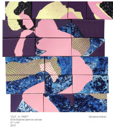
(The painting Cut-A-Part)

In her paintings, made usually in series formats, she uses oils, acrylics with enamel paints on canvas to aptly depict the dichotomy and confusion in today's times experienced by everyone, with respect to social, traditional and political classifications. Her work titled, 'Cut-A-Part' displays multiple canvases painted with enamels and oils, where each small sized canvas is placed to form an unsolved jigsaw puzzle like formation. Upon closer observations, one can see bits and pieces of a female form, fragmented and broken placed randomly. What the artist brings to the viewer's attention may not be actual mutilation of a female body, but how a troubled oppressed individual might actually be seen in her distorted mental and psychological state.