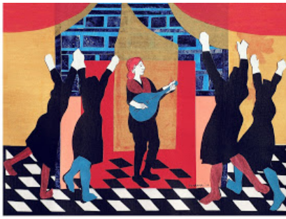
Life After Liberation Mixed media and collage on paper, 2012 40 x 40 cm Vandana Kothari