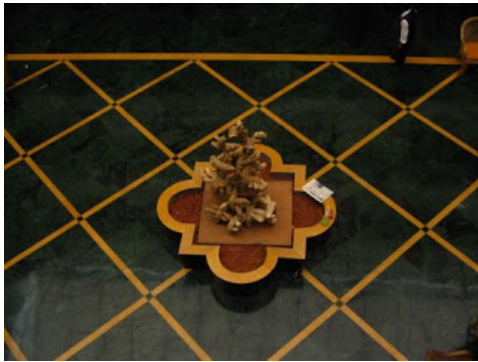
(The sculpture - Kalpa-Vruksha)

'Trumpet Blowers' is a statement about human vanity, and fall from grace, while 'Life After Liberation' with the rejoicing forms in the collage engaged in merriment proves the freedom one could feel when the baggages of the past and egotistic conditionings have been lifted or demolished. One can see the influences of Matisse in the paper cut out works of the artist but in a language and concept completely her own.