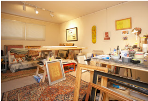
(Mural Art Workshop)

Gayathri Art Galore, Chennai, calls out for participants for a unique workshop on making murals. Murals are any piece of artwork painted or applied directly on a wall ceiling or other larger permanent surfaces. This kind of painting incorporates the architectural elements into the mural and homogenizes the visual with elegance.