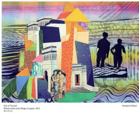
(The work - City of Turmoil)

At one glance playful, at once painful or serious, these collage works bring out the facets of the artist's persona and her thought processes. In one of her earlier collages from 2010, titled, 'The Art of looking sideways', a man sits in front of an easel, in profile and on the easel is placed a picture / painting of a female face looking at the viewer. The entire work seems to be made with a twisted sense of reality in mind and the artist seems to be bringing out the bigger irony of looking at things in life as a larger perspective but sideways. When confronted with the inability to see things straight, look sideways, is what she seems to be saying. The work also looks at the artist, in the studio space and with the work of art and their interactions within the space. The colours in this collage are muted with some portions hand painted and textured.