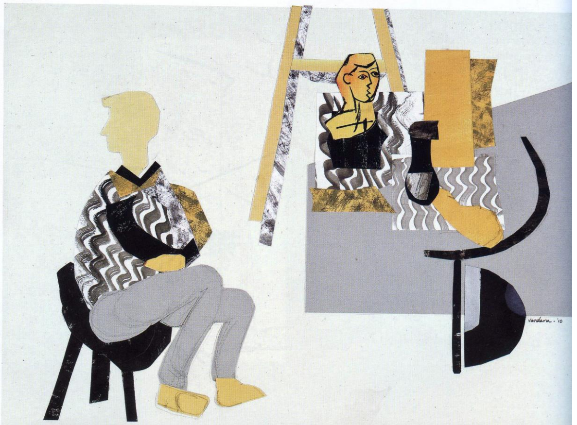
(Bottom) Vandana Kothari, The art of looking sideways , Mixed media & collage on paper, 22 x 18 inches (with frame), 2010