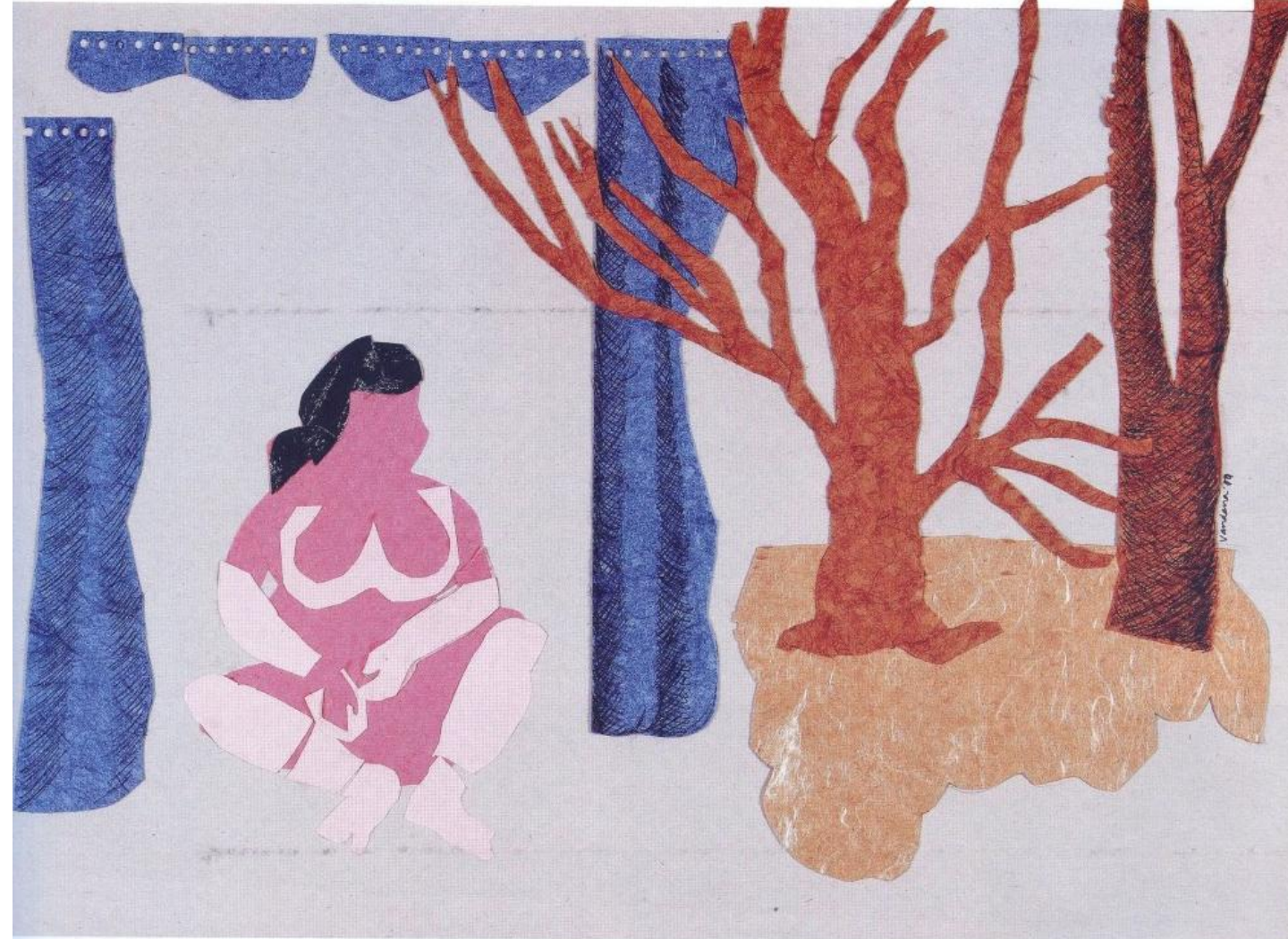
(Top) Vandana Kothari, Six degrees of separation , Collage on paper, 22 x 18 inches (with frame), 2010