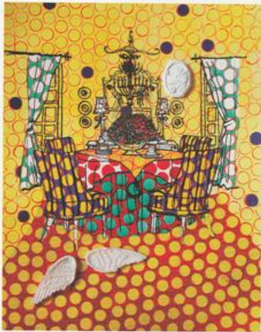
Drawing Room Series 4, Mixed Media on Paper, 11" x 14", 2017