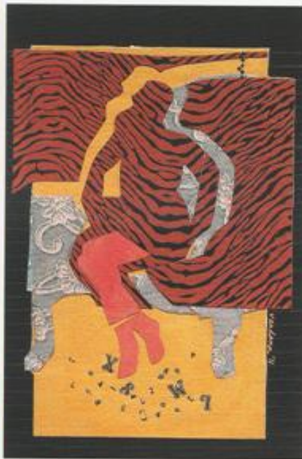
The Tiger - Skinned, Mixed Media on Paper, 5.5" x 8.5", 2011